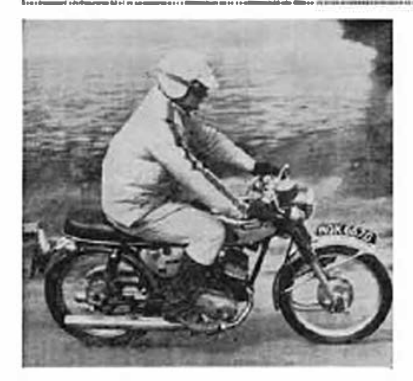
The 125 YAS-1 is proven quite capable of keeping up a steady 60 mph with 10 or so mph in reserve.

Due to successful racing accomplishments by the Yamaha prototype 125 cc production racers which made experimental outing in the 1969 world championship series, the 125 cc YAS 1, most enjoyable sportcycle on the road has been spotlighted afresh. This featherlight handling bike may not be so rapid as its forthcoming brethren, but changes up and down the box have that sporty crispness sufficient to convince any rider that it is one of the most typical models produced by Yamaha's world-famed technique.