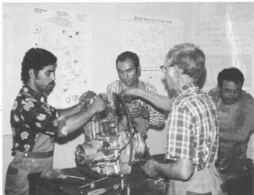
Improved service techniques on the side of local mechanics will further expand the market for Yamaha motorcycles.

Their effort took shape and several hundred machines of TX 750 and XS650 demonstrated their flawless performance throughout the 16-day session of the Meet.