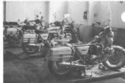
Yamaha police bikes.