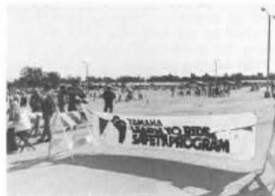
Popularity-winning LTR session.