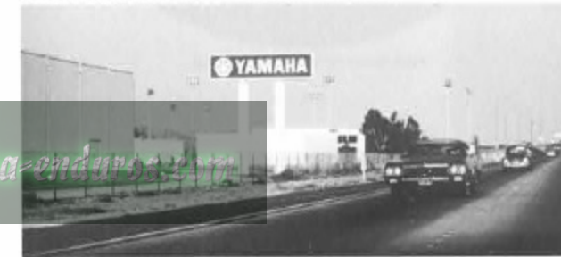
Yamaha International Corporation

Quite naturally, ensued from it the largest boom of motorcycles the United States ever had.