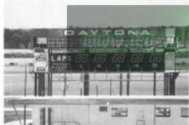
Daytona International Speedway's leaders board