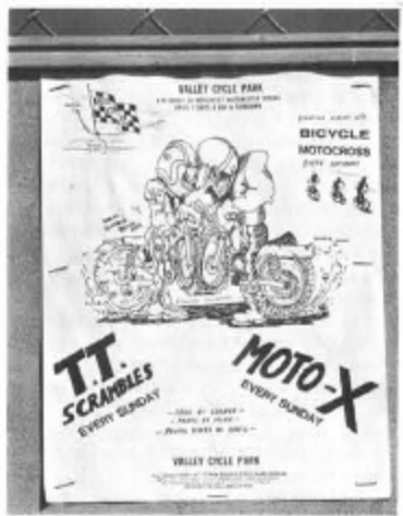
Sport events take place on Sunday every week.