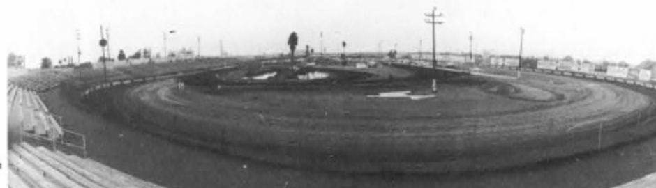
Ascot Park's dirt track.

Now, it is Yamaha that is taking a part of motorcycle sport pacesetter in the United States. The stories concerning brilliant success by Yamaha riders have been so often told, that's to say, Ken Robert's winning Grand National Championship, Pierr Karsmarkor's lead in big moto-cross events, most recently, Don Vesco's fabulous speed record at Salt Flats, Bonneville, etc. But, even apart from those sensational sport activities by top class professional riders, it is also marvellous to see Yamaha machines ridden by an increasing number of novice sport enthusiasts of various age groups, male or female.