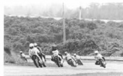
Struggling for the lead