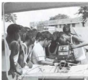
Service check for outboard motors.