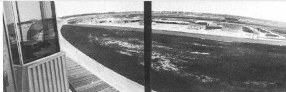
A whole view can be commanded from the control tower. (Daytona)