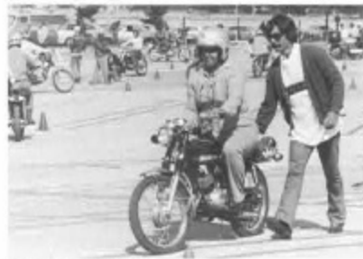
Let's start now!

Now, introduced here are the vivid scenes of the 2-day session which was recently organized in Saint Louis, Missouri. The session attracted some 1,600 enthusiastic novice motorcyclists and ended in a noteworthy success.