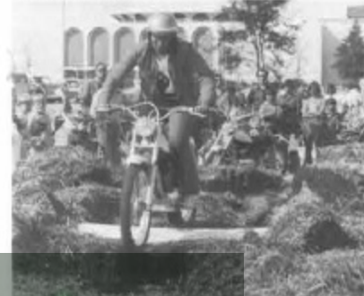
Trial riding demonstration.