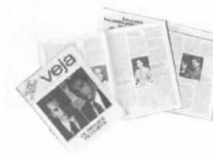
Local response is tremendous.

The plant is located at an industrial estate some 17km far from the center of San Paulo. The local plants of other Japanese manufacturers are grouped together in this area.