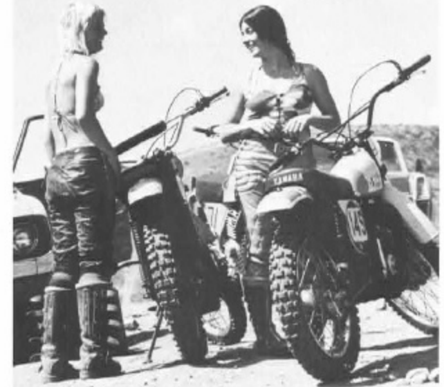
Female motocross riders