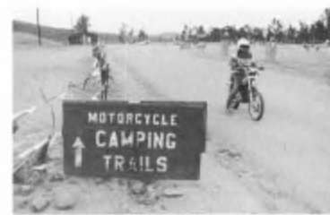
Motor parks offer safe & enjoyable grounds for them.