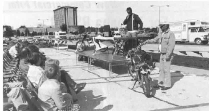
Listening to a lecturer.