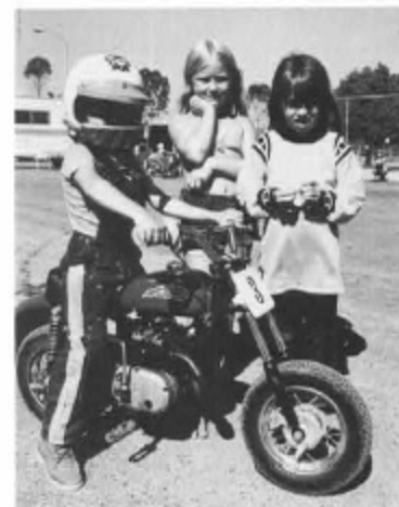
Mini Yamaha fans.