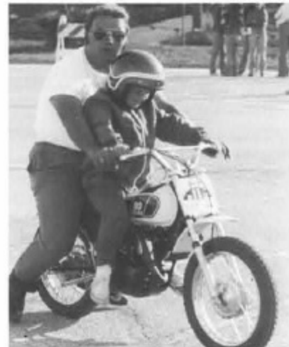
He can not reach the page!