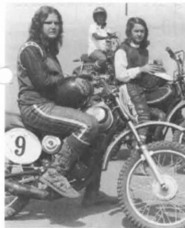
Just before start!