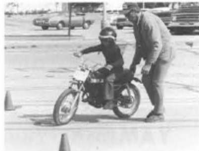
Enjoyable practice for him.