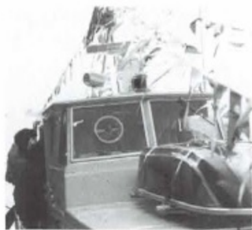
Hinode to take an important role in national medical service activity.