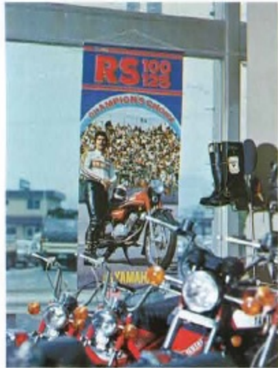
174 cm x 78 cm

With particular emphasis on visual effects it is to have on the general public, especially, road race enthusiasts, the screen is designed in a strikingly novel and impressive way, that's to say, Giacomo Agostini, reigning world champion, is taken up as a main motive in combination with the RS100, with a big crowd of spectators for a background. The main slogan is that the Yamaha RS100 is chosen even by the world champion.