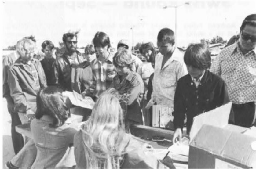
Around a reception table.