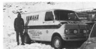
At the foot of the Alps.