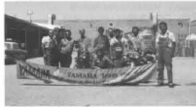
They attend the course.