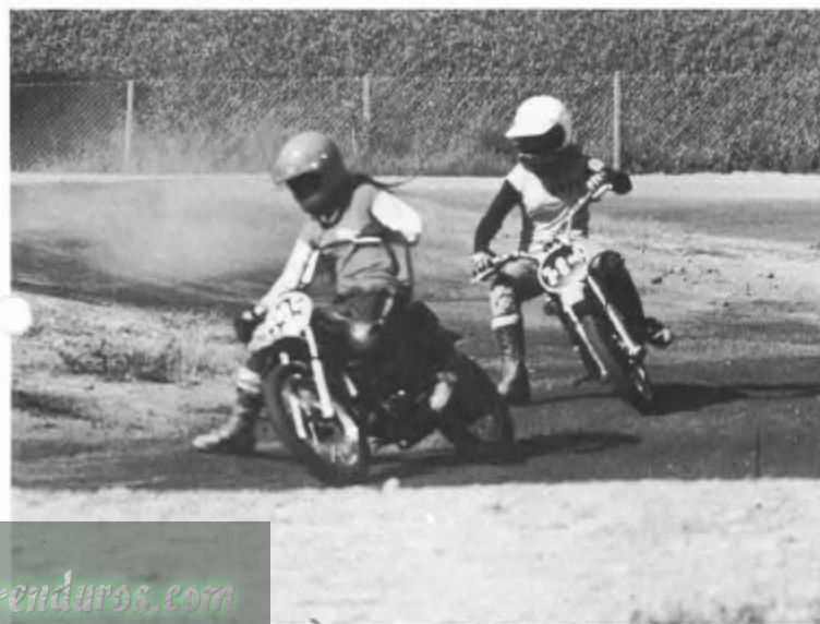
Motocross competition by youngsters.