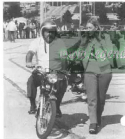
She is an instructor, too.