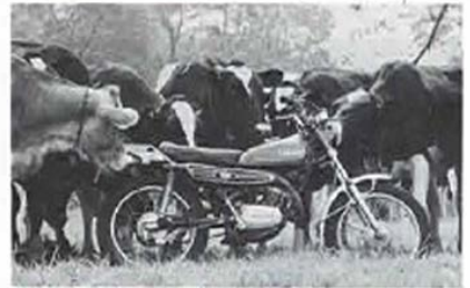
A horse? No, something strange!