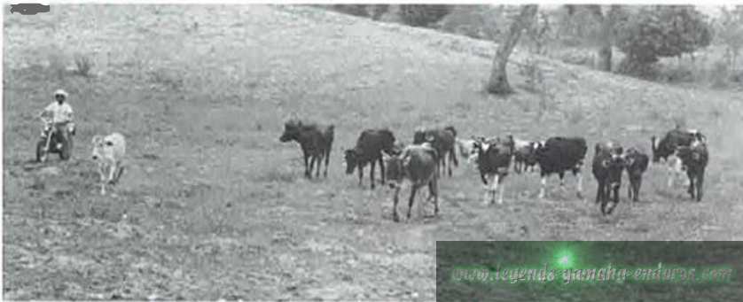
Yamaha trail bikes display their amazing mobility in managing and controlling herds of cattle.

smoothly. In addition, operation and upkeep costs prove much less than those for horses. The trail models which were exhibited by Moto/Mund S.A., the Yamaha importer in this country, enjoyed tremendous public response at the Agro Expo 73. They also hold high prospects with the forthcoming lightweight specialty bike AG 100 which will highly improve the efficiency of general farming work.