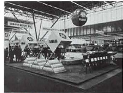
Hiswa Boat Show, Amsterdam.

The Yamaha corner featuring a full line of new models attracts a lot of spectators at each boat show in Europe.