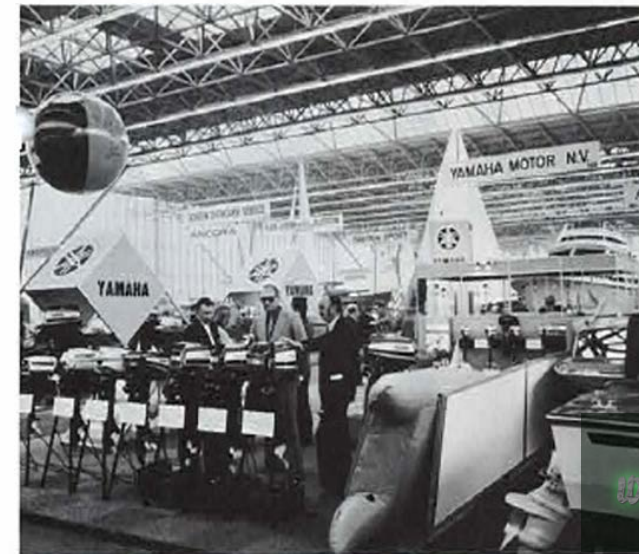
Hiswa Boat Show, Amsterdam, arranged by Yamaha Motor N.V.