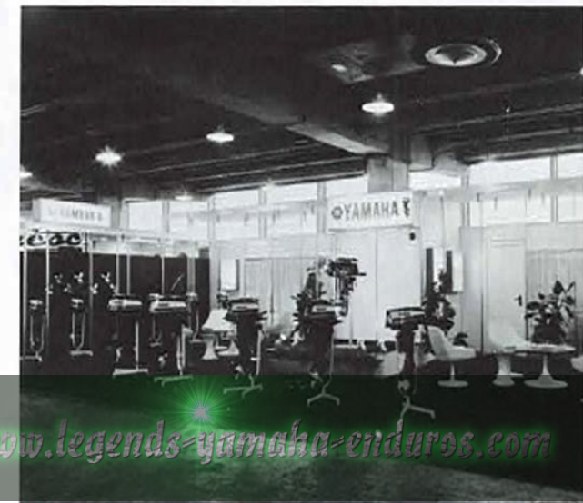
Paris Boat Show, arranged by Soditomy Moteurs Hord-Bord Yamaha