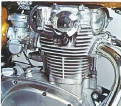
Designed for unmatched performance and superb economy, its powerplant features special wet-sump trochoid pump and twin 33mm constant velocity carburetor for accurate oil supply.