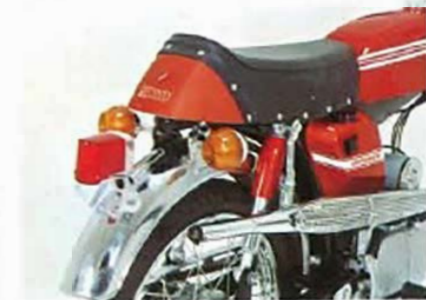
Racer-type seat together with upswept muffer will enable a rider to enjoy full sporty feeling.

Lubrication system ..... Primary kick starter Transmission ..... 6-speed gearbox DIMENSIONS Overall length ..... 1,755 mm (69.1 in.) Overall width ..... 555 mm (21.9 in.) Overall height ..... 935 mm (36.8 in.) Wheelbase ..... 1,160 mm (45.7 in.) Min. ground clearance ..... 135 mm (5.3 in.) WEIGHT (Net) ..... 70 kgs (154 lbs) FUEL TANK CAPACITY 6.0 lit. (1.6 US gal.) OIL TANK CAPACITY 1.4 lit. (1.5 US qt.) TIRES front ..... 2.25-17-4 PR rear ..... 2.50-17-4 PR