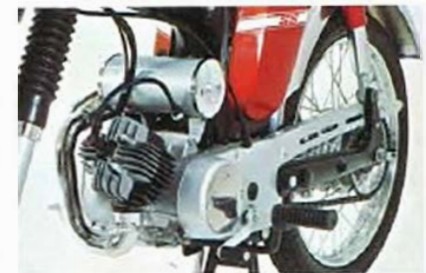
Dependable and powerful 2-stroke rotary valve engine delivers a maximum output of 6hp/9000rpm.

The 50cc FS1's mandarin orange finished fuel tank never fails to attract particular attention.