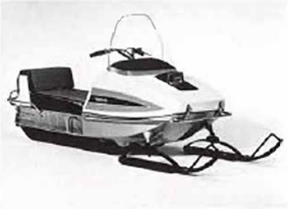
Shown here is Export Model SW400.

The Yamaha Outboard Motor Series, underlaid by Yamaha's superb motorcycle-manufacturing techniques, is steadily increasing its share abroad. In Central and South America, especially in Brazil, where immigrants from Japan are very active in every field of society, Yamaha outboard motors recently put on the market are gaining a spectacular popularity because of their superior performance and easiness of operation. Yamaha outboard motors were originally imported by the Taiyodo, importer in Brazil, with much hesitation, but they are now selling remarkably well and leading the market, surpassing their famous rival