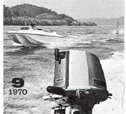
Shown here is a Yamaha Outboard Motor P-250, introduced in "Business Brazil," a magazine in Japanese published in Brazil.

brands of old standing, such as Johnson and Mercury.