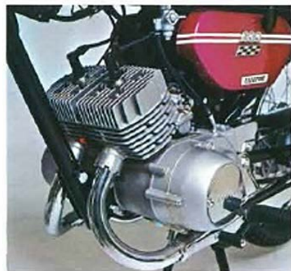
Performance figures of its powerplant are so exciting and exceed levels in its class.

Lubrication system ..... Autolube Starting system Electric & Primary kick starter Transmission ..... 5-speed gearbox DIMENSIONS Overall length ..... 1.905 mm (75.0 in.) Overall width ..... 780 mm (30.7 in.) Overall height ..... 1.085 mm (42.7 in.) Wheelbase ..... 1.245 mm (49.0 in.) Min. ground clearance ..... 150 mm (5.9 in.) WEIGHT (Net) ..... 116 kgs. (255 lbs.) FUEL TANK CAPACITY 9 liters (2.4 US gal.) OIL TANK CAPACITY 1.9 liters (2.4 US qt.) TIRES front ..... 2.7618-4 PR rear ..... 3.00-18-4 PR