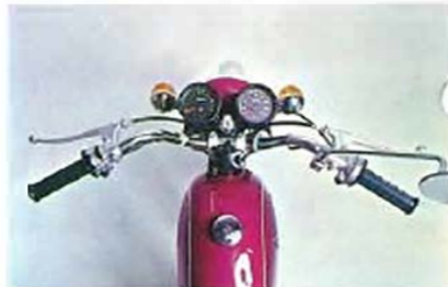
Metalllic purple finished fuel tank is another accent in appearance, and meters are very readable.

through city traffics, it put you in the gear you want very effortlessly. An electric starter plus primary kick starter greatly benefits a rider to get an engine enlivened with the least efforts. Larger and brighter headlamp assures clearer night vision for the sake of more safety. Moreover, sparkling metallic purple finish make this model most eye-catching wherever it goes.