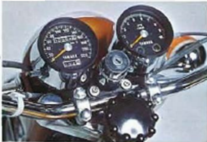
Meters are very accessible and readable.