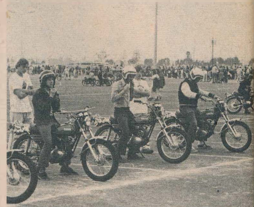
Students moved from area to area. Here they get their first on-bike experience.