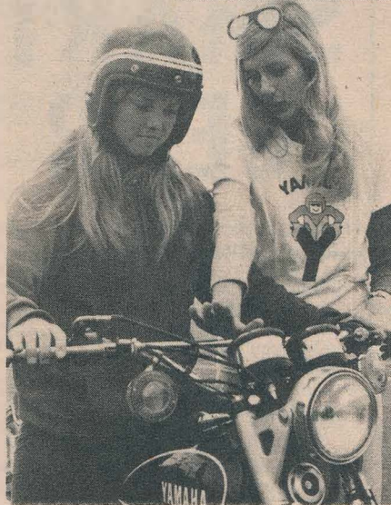
Students were of all sizes, ages and sexes. The instructor, shown here describing the controls of the 125cc Yamaha, isn't bad either.

The main thrust of the program is teaching motorcycle safety and it begins with an introduction to the motorcycle. Yamaha 125 enduro bikes are used for the school and all riders are furnished with helmets. In the first stage, the instructor takes the students in groups of five and explains the layout of controls and the basics of riding. The students sit on the bikes and actually work the clutch, brakes, starter and turn indicators. They are also taught the proper method for starting the bike.