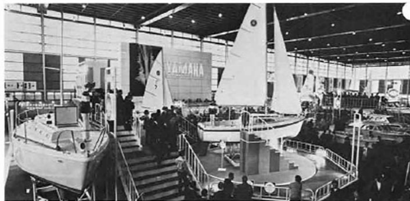
▼ Handy Yamaha row boats assure them of tremendous fun.