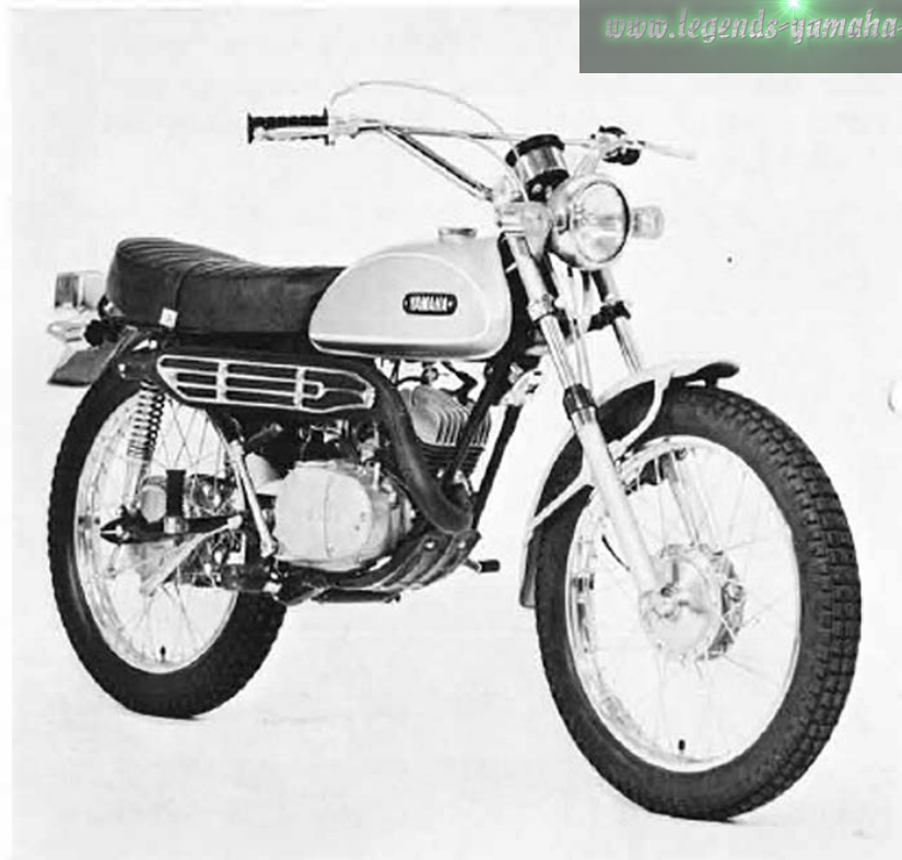
The Yamaha 90 Trail HT 1 is an ideal ultra-lightweight bike intended for novice trail enthusiasts. It is finished in sparkling candy orange. Its impression as a whole is "Elastic and Fresh" differed from the massive 360 RT 1.

Autolube engine has a 5-speed gearbox with a wet multi-plate clutch. This power unit is compactly installed on the rugged double-cradle frame. The front fork's spring housed in the bottom case and 3-stage rear cushion efficiently operate for absorbing shock on whatever type of riding conditions. Just as on other models of the series, both brakes are perfectly dust-free and water-proof.