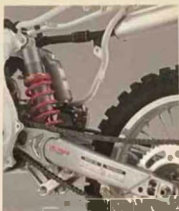
Monocross rear suspension with Deltabox swinging arm