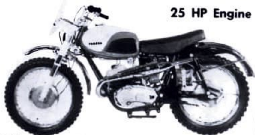
GRAND PRIX SCRAMBLER TWIN—250cc—Metallic Gold & White

Rapid Acceleration Smooth Performance Comfortable Ride Alternate Firing Twin Runs and Sounds like a 4 Telescopic Forks (hydraulic) Alloy full-width hubs 4 Speed Gear Box Quiet Mufflers Turn indicator lights Comes with high bars $565. FOB L.A. & Portland $575. FOB Philadelphia