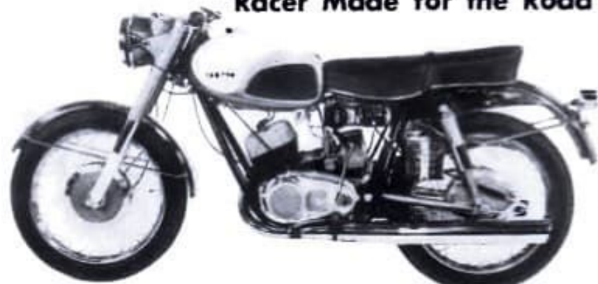
GRAND PRIX SPORTS TWIN—250cc Metallic Gold & White