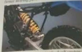
Yamaha's Monostrut single shock suspension has been developed and proven on race-winning YZ motocross bikes. It gives a true rising rate by virtue of a sophisticated linkage, allowing free movement over small bumps with more control when the terrain gets tougher. On the IT200, it features a remote reservoir, infinitely adjustable preload, and rebound and compression damping adjustments.