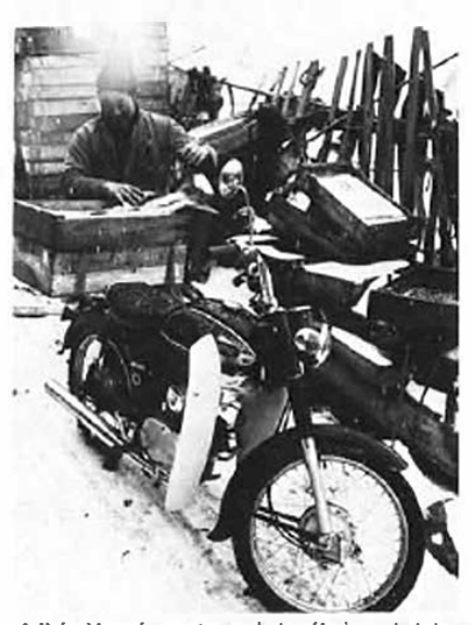
A light Yameha motorcycle is offering a helping hand in carrying fish.