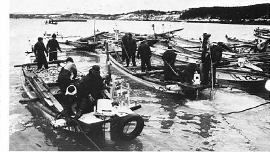
What a bumper! A fishing base is buzzing with exctement.

Akita Prefecture, Northeast Japan is very famous for its shallow-sea fishery of hatahata (a sort of codfish). This fish has a habit to gather in schools around the coast of Akita late in autumn each year. Recently Yamaha outboard motors have appeared in the scenes of hatahata catching. Japanese boats equipped with light and compact Yamahas are assuring fishermen of a larger catch of hatahata than ever.