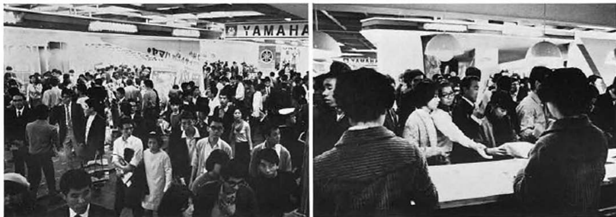
Spectators thronging around Yamaha corner reflect enormous popularity to products.

of an Indian holding his hatchet aloft, sitting astride a Yamaha was specially acclaimed, as it looked almost real and excellently expressed the mobility of trail bikes. Of three models, a 360cc and 90cc ones were entirely new models developed by Yamaha intending to make their leading position further advanced.