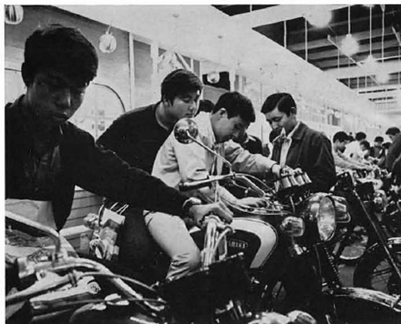
Young fans are delightful to sit astride new models displayed.