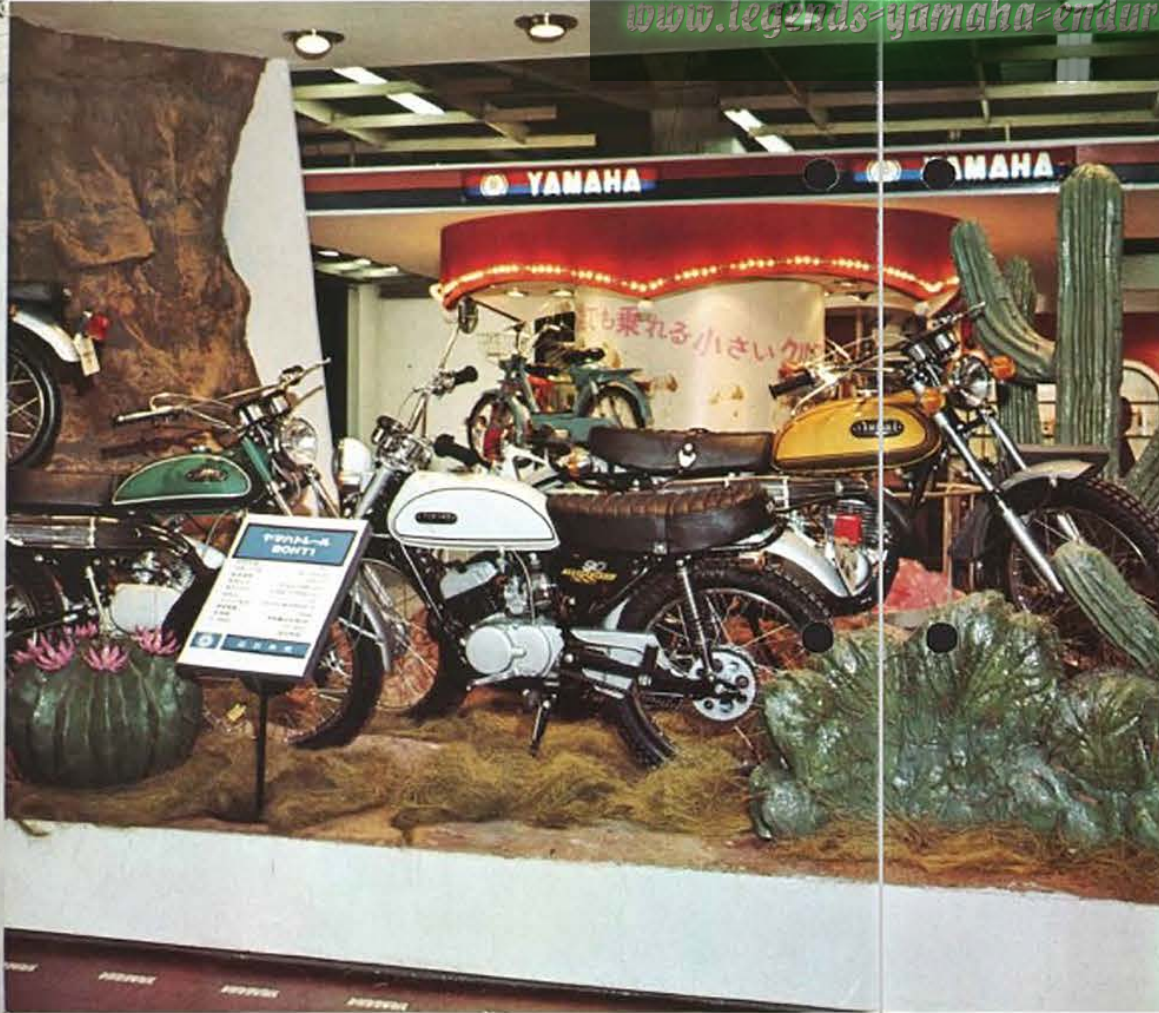
Top left: A stage coach is speeding along. A Yamaha trail bike is a dynamic one to beat a new path. Left: It really performs like a bigger machine. Let's enjoy trail runs in harmony with surrounding nature! Top: A man, conqueror of wild plains and a selected bike, Yamaha Trail. Bottom: Yamaha have held a predominant position in the development of trail bikes. The Yamaha Ranch is symbolizing Yamaha's evergrowing energy. The Yamaha corner where models are exhibited in Western moods is winning much popularity.