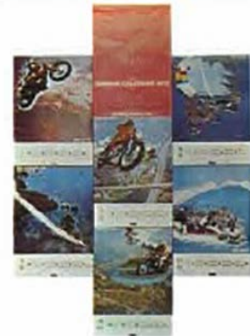
size: 59.4 x 42.0 cm

Calendar type B (left) introduces in the most impressive way how Japanese girls enjoy their life with Yamaha motorcycles.