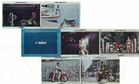
size: 42.0 x 59.4 cm

Both are color printed and consist of 7 sheets including a front cover, respectively. Please make full use of them.