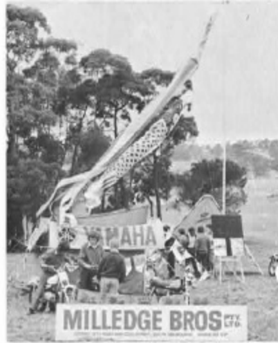
Carp streamers add extra interest to the event.

The Gippsland Field Days which are annually organized at Orange, New South Wales, Australia, is now considered a very good place for making Yamaha motorcycles widely known to the general public. Milledge Bros Pty. Ltd., distributors for Yamaha in this part of Australia arranged the Yamaha stand at this year's event, displaying a full line of Yamaha's off-the-road models including the unique AG series (agricultural bikes) and the production trials models TY80 and TY250, all of which had a greater impact on a lot of visitors. As for the AG bikes, slow uphill climbing and zig-zagging for following sheep and dairy cattle were performed very successfully. Farmers were allowed to experience the performance of all demonstration bikes and were full of praise and enthusiasm.