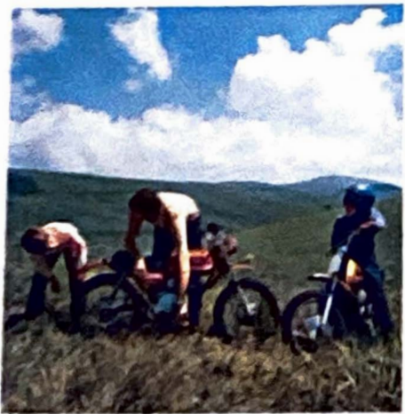
It's a wonderful world of kids, large and small. No bigger thrill than to watch their faces when you give 'em their first machine, or take 'em on a trail ride... or just sit back and watch 'em learn to ride. It's a happy world and it's yours... from YAMAHA.