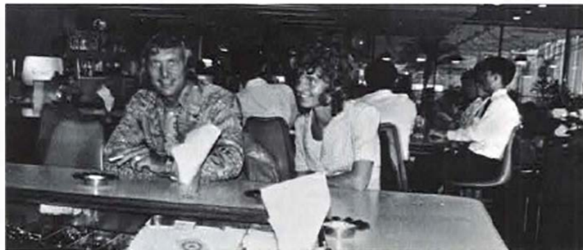
Photo: at the rest room of the Hsueda Airport,