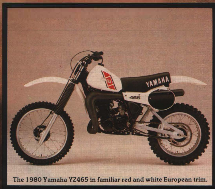
The 1980 Yamaha YZ465 in familiar red and white European trim.

The rip-snortingest, sand-slingingest, knob-rippingest, turf-chunkingest monstercrosser ever to wrinkle the crust of the earth . . . so far