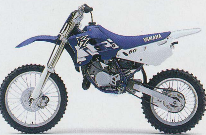
YZ80LW IKB (Ink Blue)