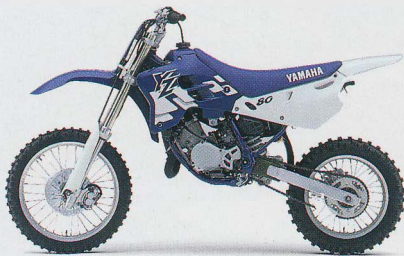
YZ80 IKB (Ink Blue)

An uprated gearbox makes for improved durability and slicker shifting. And with a YZ250-type front master cylinder and high friction sintered pads you've got all the brake power you need. Yamaha YZ80 and YZ80LW. Smart technology. Smart choice.