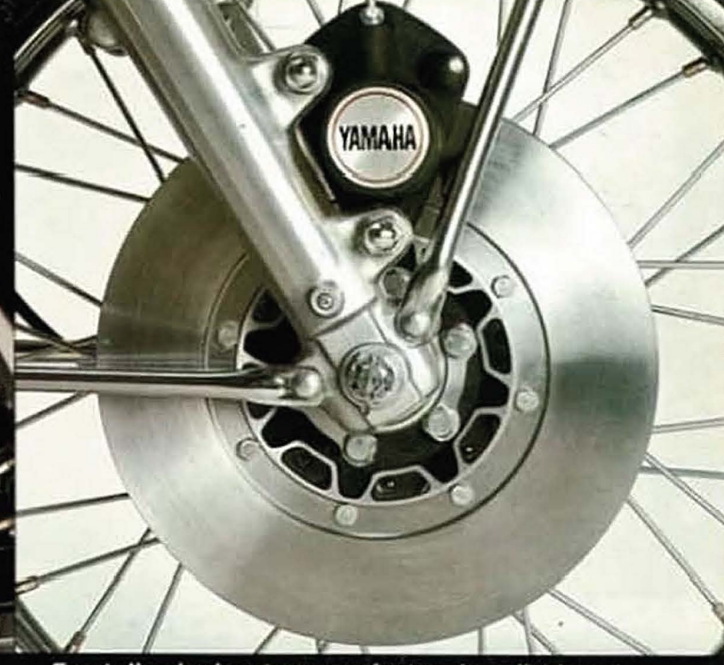
Front disc brake stops you faster. An adjustment screw lets you set the hand-lever for the exact "feel" you prefer. The enduro-type front forks will soak up the hardest jolts and resist bottoming.