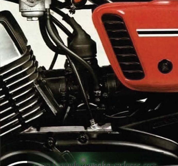
Torque Induction, Yamaha's unique intake system, utilizes a reed valve to feed the engine the exact amount of fuel and air it needs. The result is more horsepower, particularly at low rpm's.