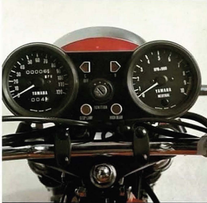
Complete instrumentation includes fully illuminated speedometer, tachometer, and resettable trip odometer. Ignition key also locks accessories compartment, helmet hanger, steering handle, and gas tank.