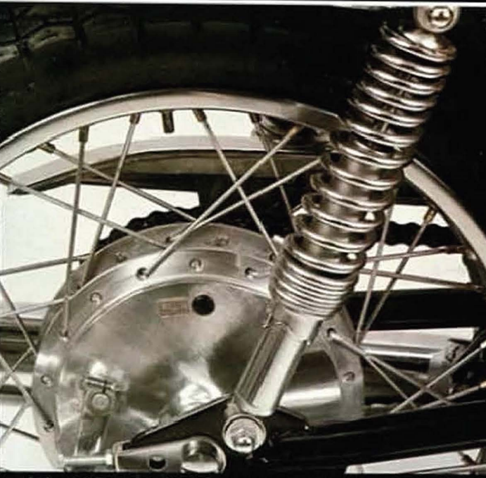
Adjustable rear shocks can be set at three different positions, according to the load you're carrying or the condition of the road. Yamaha's brakes have traditionally set the industry standard for sure stopping.