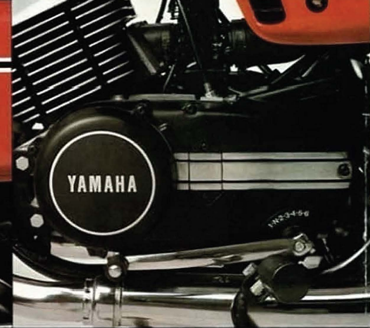
Six-speed transmission keeps the engine running at its most efficient speed. The short-throw shift lever lets you change gears quickly, without lifting your foot from the peg. Yamaha gearboxes are notoriously runged.