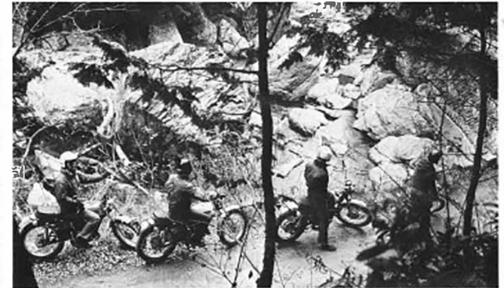
A swift current is dashing against rocks, they are just taking a rest in expectation of something adventurous ahead.

Then, clad yourself in tough leather suits and boots against rough nature-going. Just remember that your bike is required of dynamic but elastic mobility anywhere over the course. Too much luggage will prevent your bike from free going.