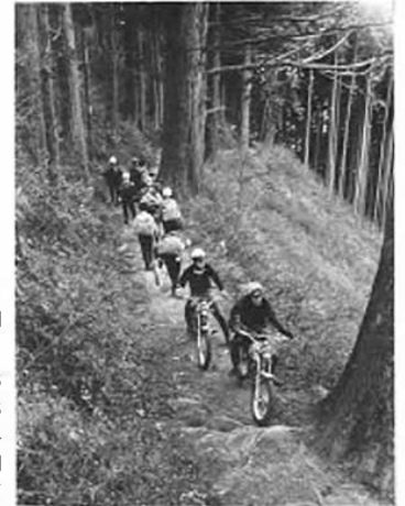
They have just passed by a party of hikers, following a mountain path.

Trail, it is rough-nature-going full of pleasure, thrill and excitement. It is in swelling boom among active young enthusiasts. They ride their bikes into rough natures in expectation of something adventurous, or sometimes, a bit of romance, trotting through woods, speeding across wild plains, going over swift currents, following a path along a long stretch of hills and even climbing mountains.