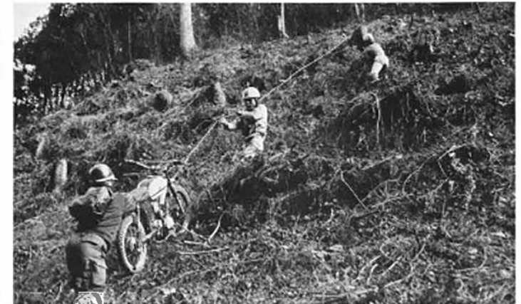
Pulling a bike up needs combined efforts. A rope is absolutely indispensable to this work. Mountain trail gives them unsurpassed thrill and fun.

Now, trail preparations are all OK. Go out into rough natures at once. Enjoy fully a world of fresh fun and excitement unfolding itself around you: