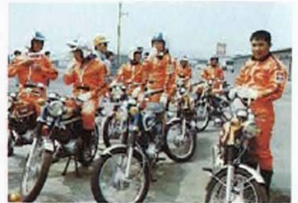
OR race by retired veterans