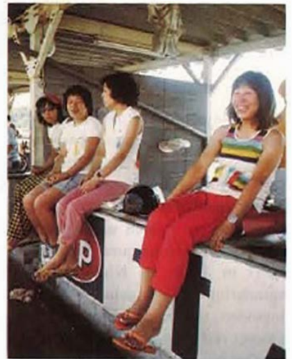
A scene of pit