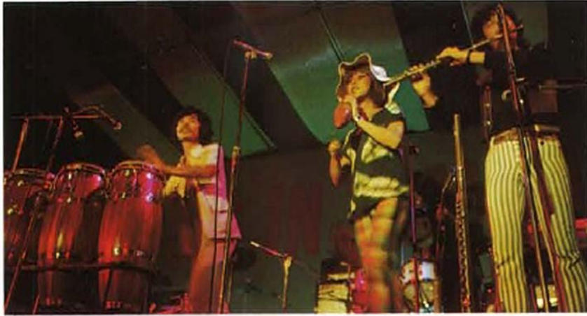
Popular singers on the stage (above), and youthful excitement (right)