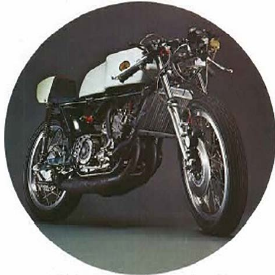
Fabulous water-cooled 350cc works machine