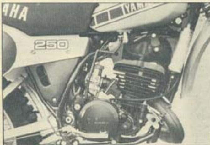
New exhaust pipe has an enormous head and baby section. It could use a heat shield to prevent fire burns.