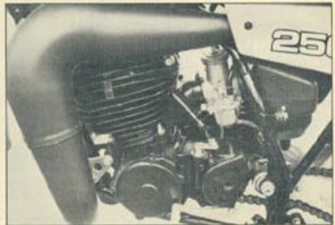
1990 engine is not an updated "F" unit. It's new from the cases on up. Mono reservoir is mounted on the downtube this year.