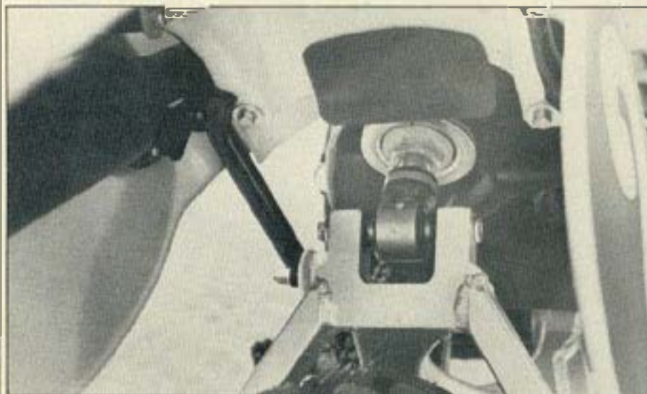
Now it's no hassle getting to the preloads and damping adjustments on the mono-shock. Just reach under the rear fender and dial to what you want.