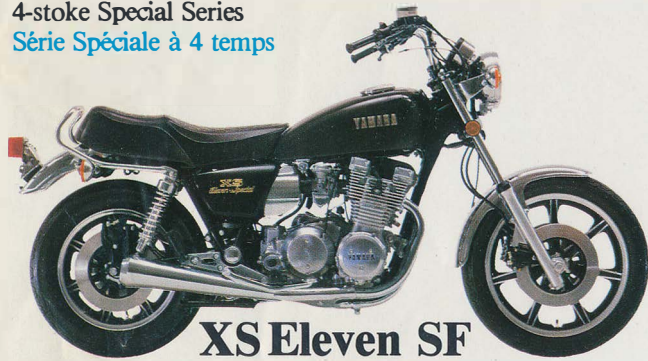
XS Eleven SF

4-stroke Special Series Série Spéciale à 4 temps