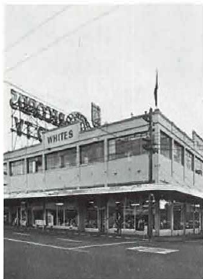
W. White Ltd. is steadily enlarging the market share of Yamaha motorcycles in this part of the world.