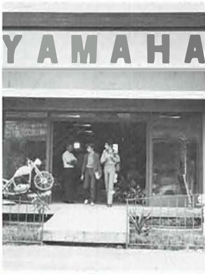
Dino Motor in San Paulo is always brisk with young enthusiasts.

Brazil is located just at the center of South America. It is the 5th largest country in the world, occupying approx. one second of the continent. This country has been long famous for its agricultural products of excellent quality represented by the world-renowned coffee, cocoa, sugar and cotton. These several years, however, greater efforts have been concentrated on the development of manufacturing and mining industries to break the image of agricultural country. San Paulo and Rio de Janeiro are the centers of progressive industrialization.