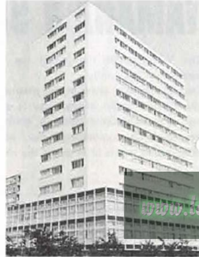
Office building of Yamaha Motor N.V.