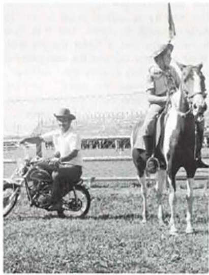
The Yamaha Mini Enduro proves sometimes tougher and faster than a horse.