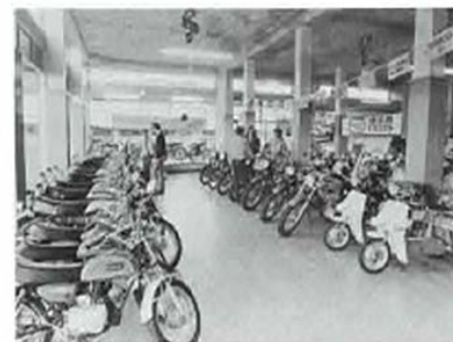
The inside layout is impressive enough to attract a lot of young enthusiasts.

New Zealand is a very promising market for Yamaha motorcycles. W. White Ltd., Yamaha distributor in Auckland has recently established a new impressive showroom of motorcycles to further expand business. New Yamahas which are arrayed over a spacious floor, draw particular attention of the sport-loving youth.