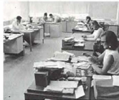
The inside office is well designed for the improvement of working efficiency.