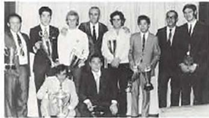
Yamaha motorcycles prove often the most successful make at big racing events, which directly combines with sales promotion. The picture was taken immediately after the prizegiving ceremony of the '71 Interlagos 500 mile race.

The market of motorcycles in general is steadily expanding here, and Yamaha is all the time strenuous to claim larger share. Yamaha Motordo Brazil Ltda. which has been established in San Paulo as the base of market activities in this part of the world, is taking a very vital role in every phase of sales promotion program.