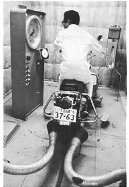
The chassis dynamometer is a unique equipment first ever employed in the facility of the kind.